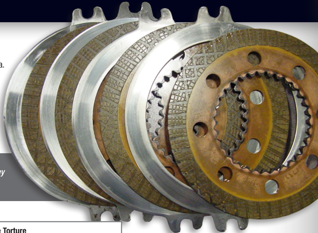
Photo of brake disc stack from actual field test – this is what they looked like after 7 months and 1,700 hours – like new!